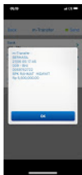
Journal Processing Fee.jpg 26K